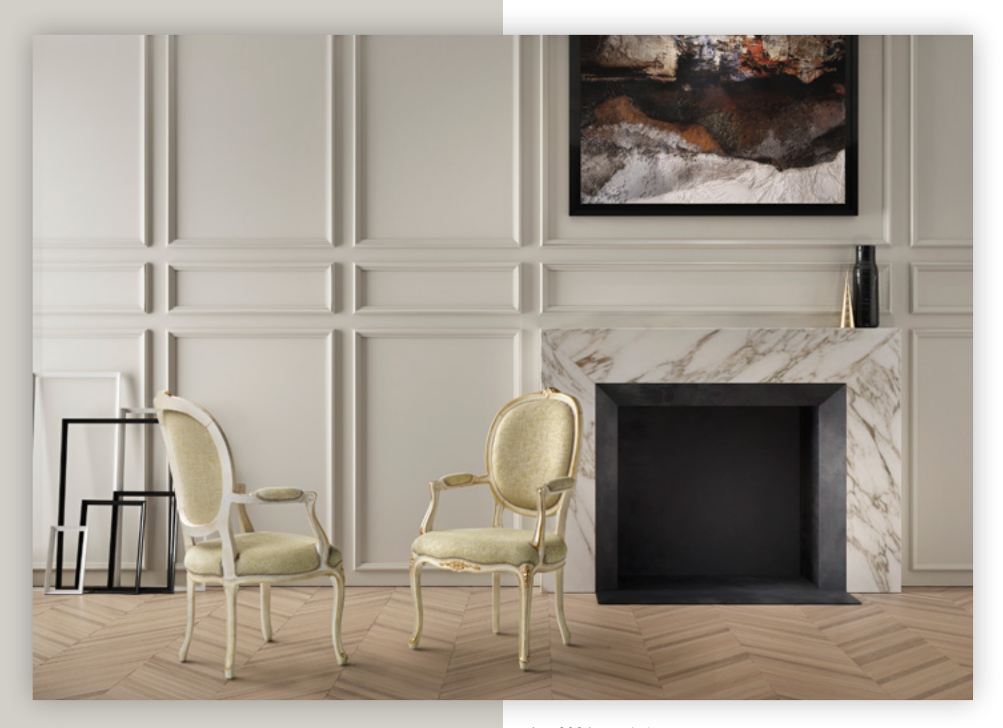
Art. 9024 Armchair